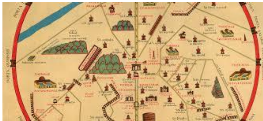
Cr. Huelsen, La Pianta di Roma dell'Anonimo Einsidlense, 1907

IMÉRA-LabexMed, LA3M; University of Cassino